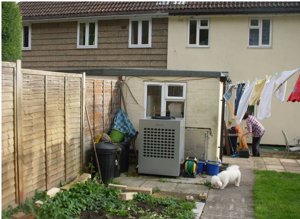
The unit in situ